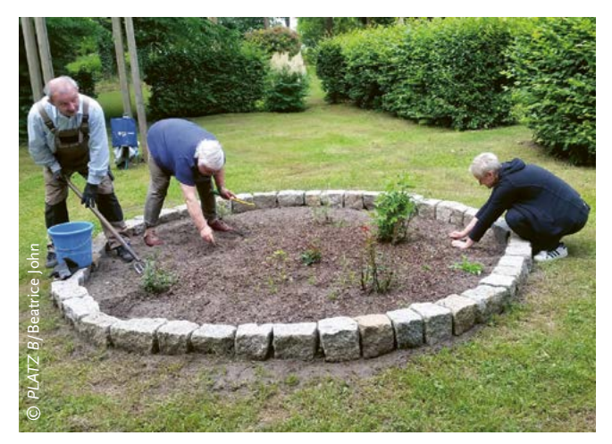
FIGURE 3: The Stadtparkfreunde during a planting event to revive a city park in Boizenburg, Mecklenburg-Vorpommern.

positive power of bonding forces between participants towards a common goal to achieve more equitable and persistent outcomes. Trust, social capital, and ultimately social cohesion can and should be one of the goals RwL activities aim for. The impact of an RwL is directly related to the type of cooperation in the laboratory and the experiments. When there is a high sense of belonging and trust among the actors involved, they are more likely to collaborate, exchange resources and knowledge, and share experiences and skills to solve problems together. On the one hand, social cohesion leads to individual actors working towards a common understanding and developing a collaborative perspective. Thus, cohesion can become a determinant of RwL success<sup>2</sup>. Social cohesion in already existing networks can advance RwL experiments, as was the case in the bus stop experiment in Boizenburg. On the other hand, RwL structures can also lead to net-