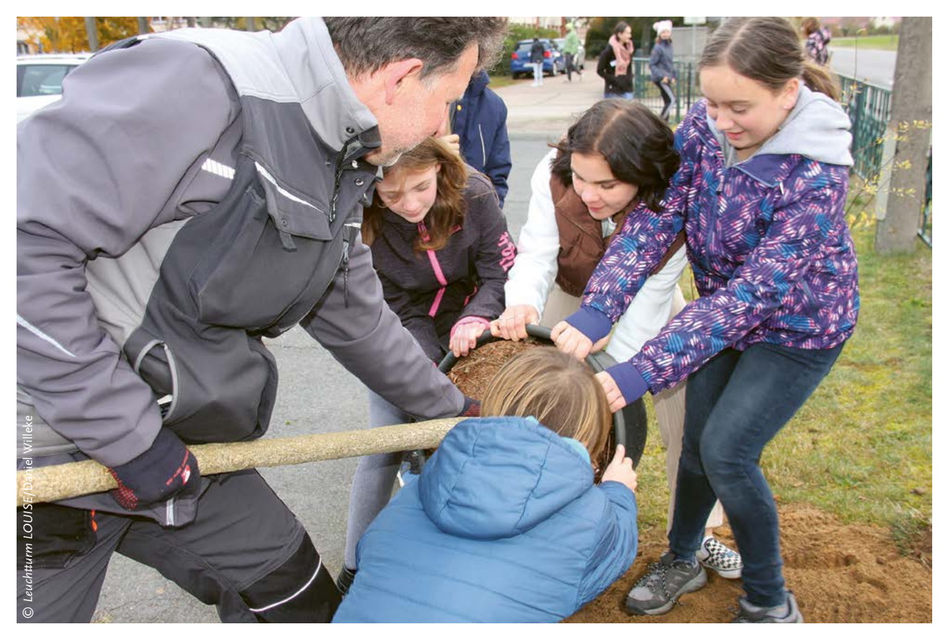
FIGURE 4: A planting initiative at a local primary school near the Leuchtturm LOUISE real-world lab (located in Elbe-Elster, Brandenburg), in collaboration with both primary and high school students.

remains to be seen as to what role social cohesion may play in the scaling of RwL processes and structures that enable these collaborative experiments.