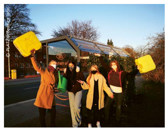
FIGURE 2: Students from Boizenburg, Mecklenburg-Vorpommern, carried out a bus stop greening project after winning the competition Boizenburg future-proof – an initiative of the real-world lab PLATZ B .

In the process of following these RwL activities and evaluating their temporal continuity and spatial transferability, we became more and more aware of the importance of social networks, common visions, as well as social and institutional trust and belonging. We therefore wondered if, with the formation of networks and local communities, social cohesion plays a significant